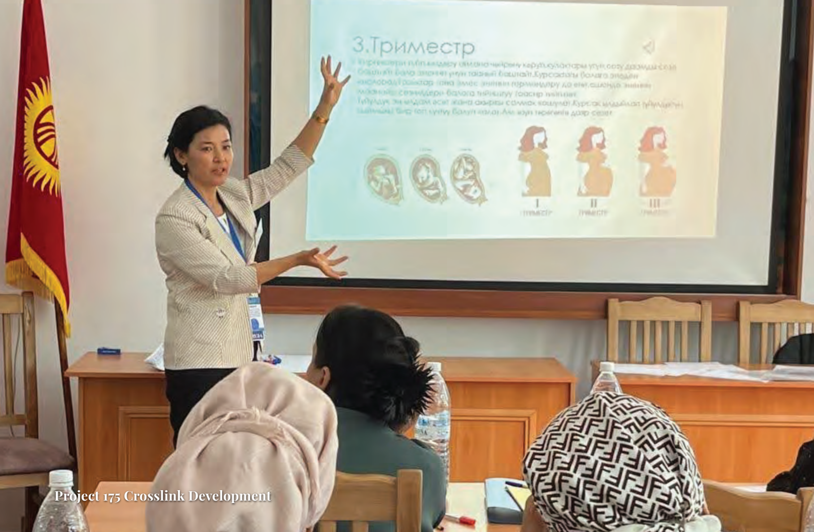
Project 175 Crosslink Development