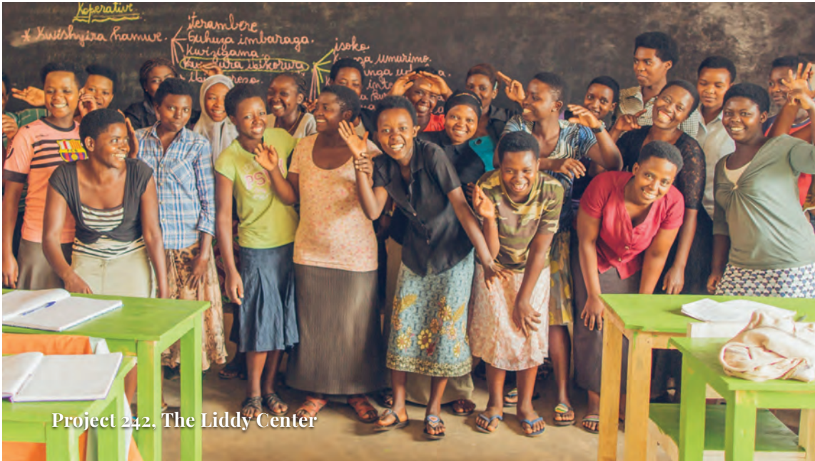
Project 242. The Liddy Center

We are grateful to have had the opportunity to support so many incredible organizations around the world. This year we saw our grants meet some unique and critical needs. Our most requested areas of support included climate mitigation work, refugee relief support, and projects focusing on jobs and skill training. Thank you so much for helping us deliver hope through your donations to communities working to overcome poverty.