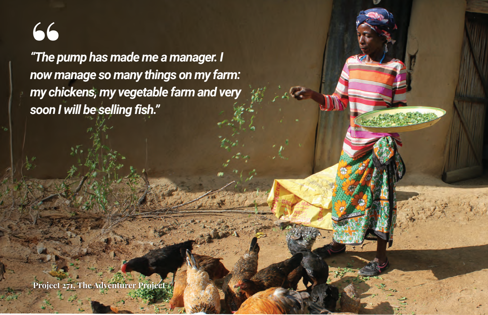
Project 271. The Adventurer Project

“The pump has made me a manager. I now manage so many things on my farm: my chickens, my vegetable farm and very soon I will be selling fish.”