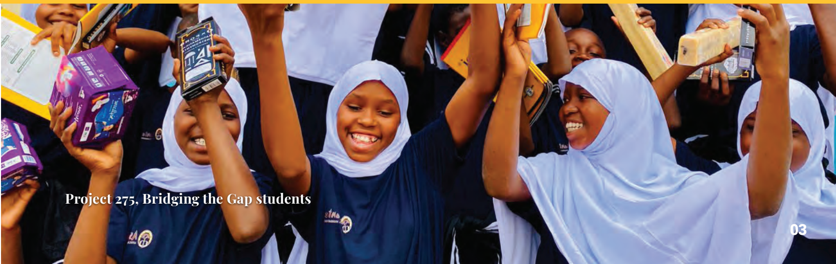
Project 275, Bridging the Gap students