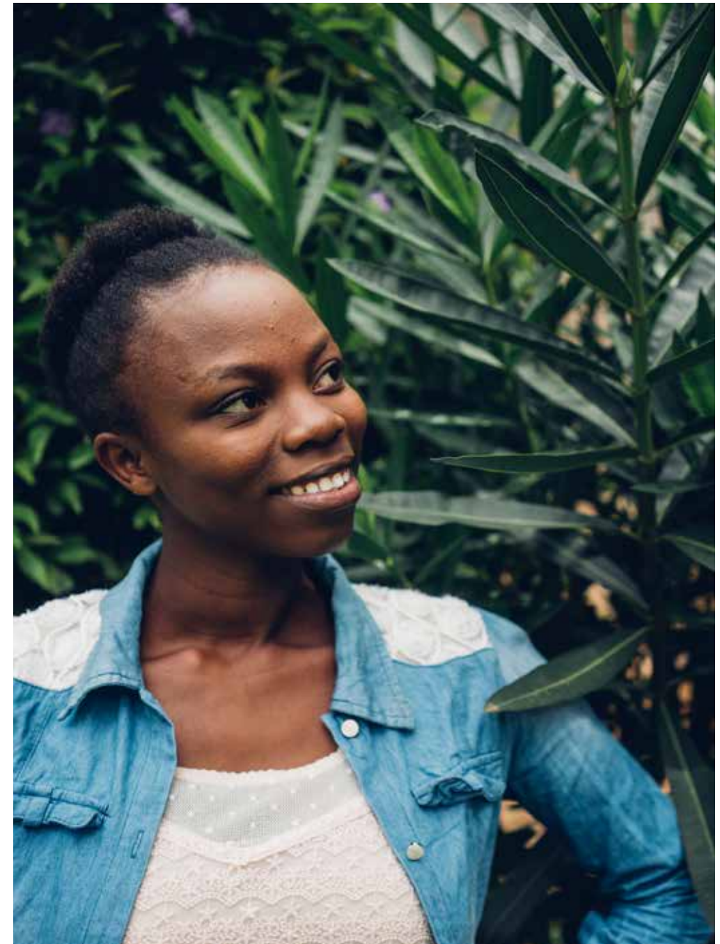
Freely in Hope, Zambia