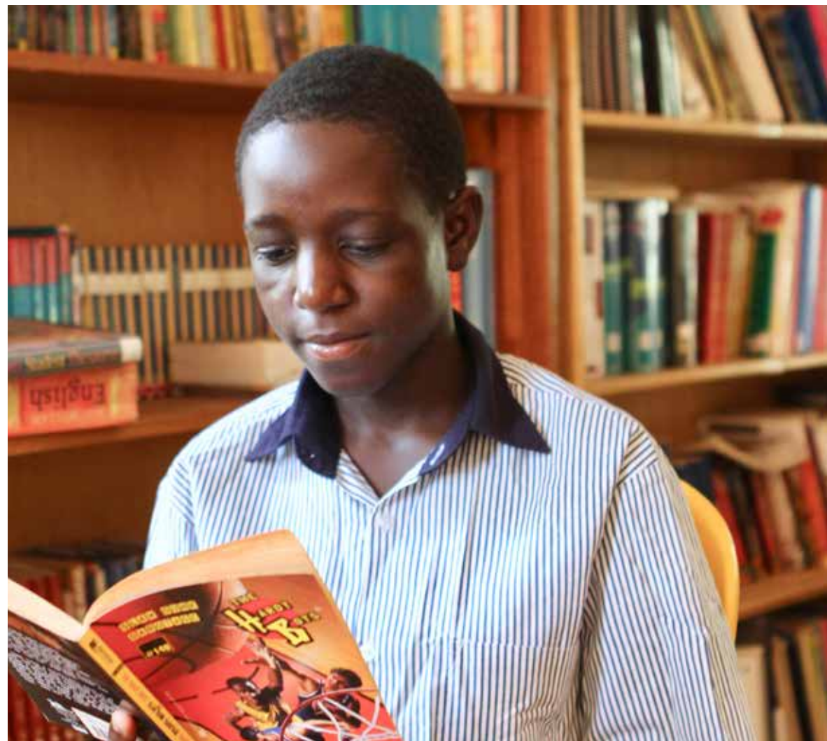
Cherish Uganda, Uganda

Our movement is fueled by individuals and communities who give their one day's wages, start a birthday campaign, host an event at their church, school, or business, run a marathon or whatever they feel inspired to do to raise funds to empower others around the world.