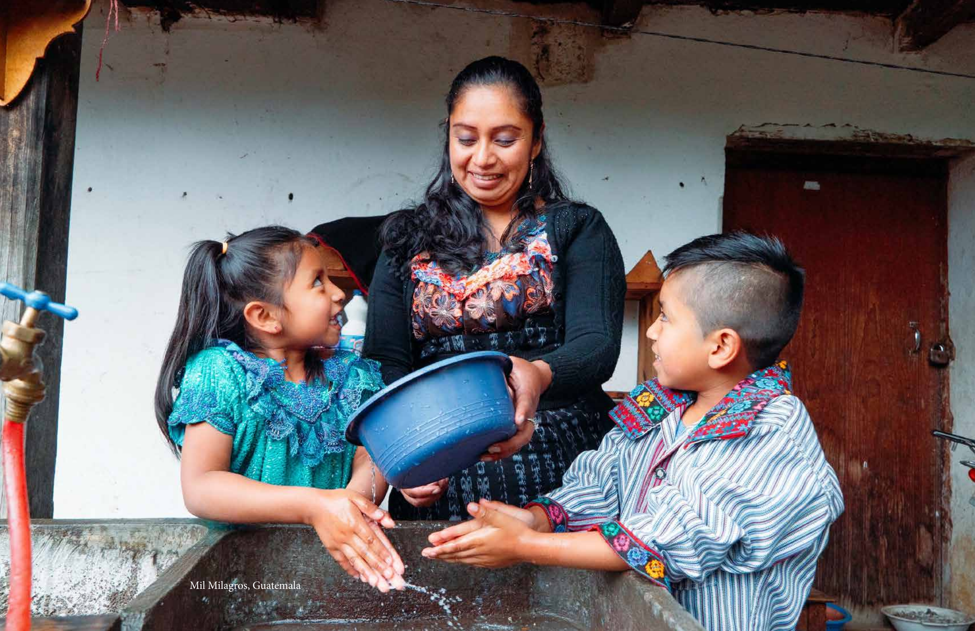
Mil Milagros, Guatemala