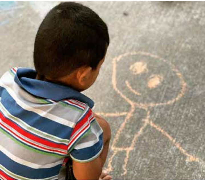
The HUG Project, Thailand

We believe that your resources should be invested well. While we know development is messy, we care about measurable and sustainable impact.