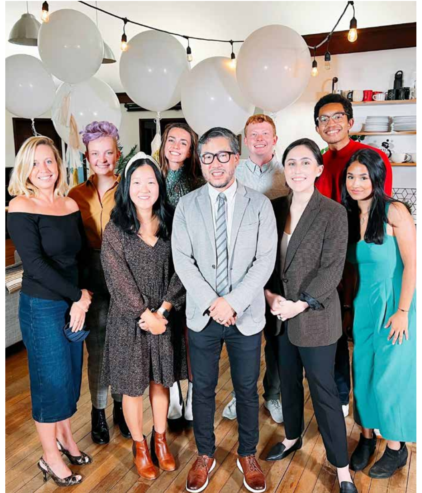
One Day's Wages Team, 2021

Our Grant Analysts work alongside our Grant Manager to help vet each organization we partner with. They look over our grant applications and write recommendations based on research and discussions with potential partners. You can learn more about getting involved as a volunteer at onedayswages.org/intern .