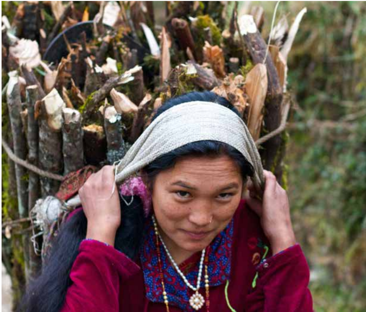
Himalayan Healthcare, Nepal