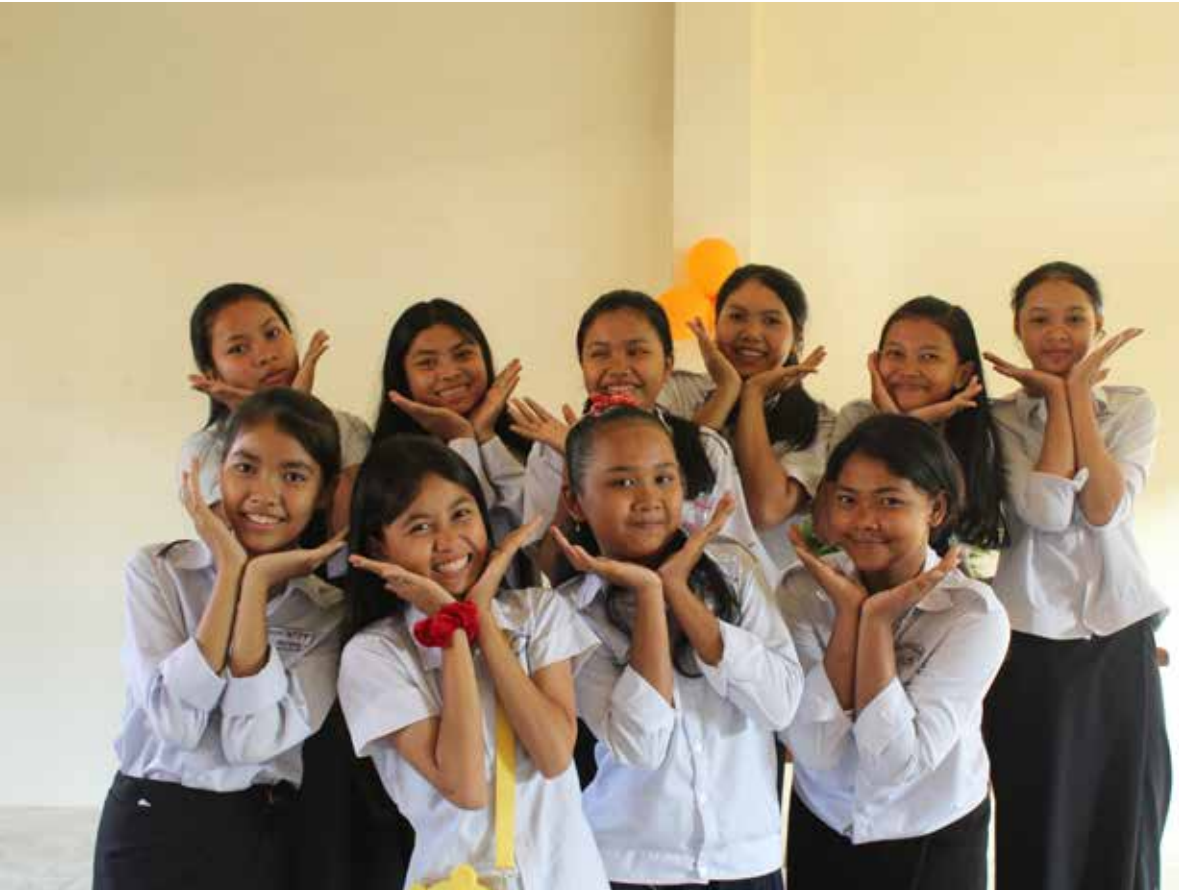
AusCam Freedom Project, Cambodia