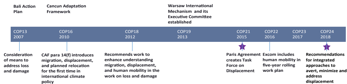
Figure 1. Emergence of human migration as a risk management topic in international climate policy

Human mobility – migration, displacement and planned relocation – has been framed as an issue of climate risk management under the UNFCCC, particularly in the work conducted under the adaptation and loss and damage work streams. The framing of risk management has evolved between the 13th Conference of the Parties (COP13) in 2007 and the 24th Conference of the Parties (COP24) in 2018. Figure 1 highlights decision milestones and progress.